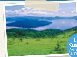
Lake Kussharo (viewed from Binoro Pass)