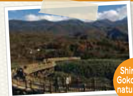
Shiretoko Goko Lakes nature trail